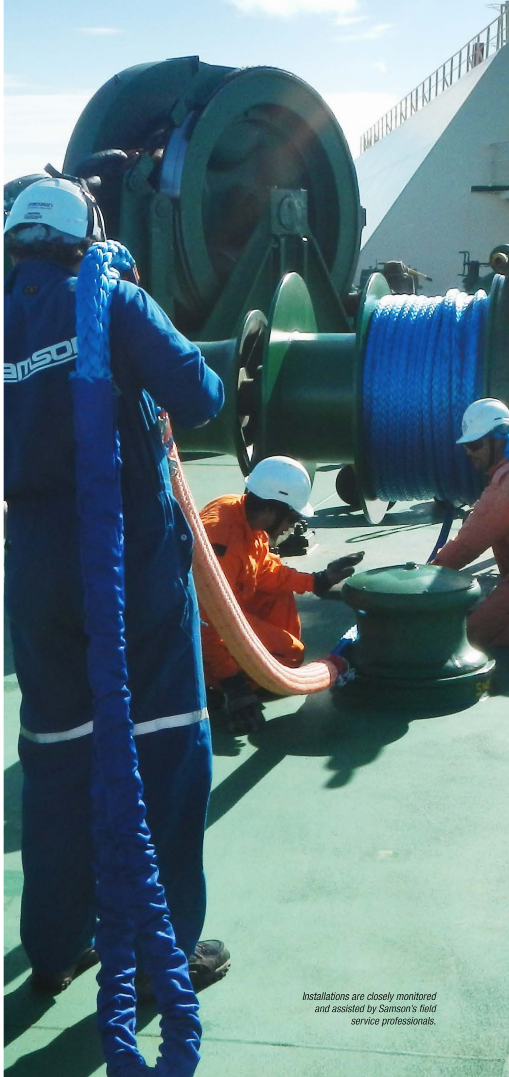
Installations are closely monitored and assisted by Samson's field service professionals.