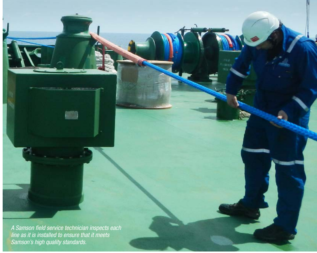
A Samson field service technician inspects each line as it is installed to ensure that it meets Samson's high quality standards.

The fleet was able to remain in operation throughout the process, with Samson staging replacement mooring systems at different ports around the globe, with field service crews deployed to assist with installations.