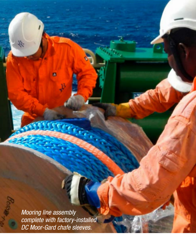
Mooring line assembly complete with factory-installed DC Moor-Gard chafe sleeves.

Samson and fiber partner DSM have long promoted the use of non-jacketed 12-strand lines in these critical mooring applications. Ease of inspection, both external and internal, is a prime consideration, along with simple splicing and repair that can often be accomplished by the ship's crew. Instead of a full jacket, chafe gear is placed in critical locations to protect the rope where needed.