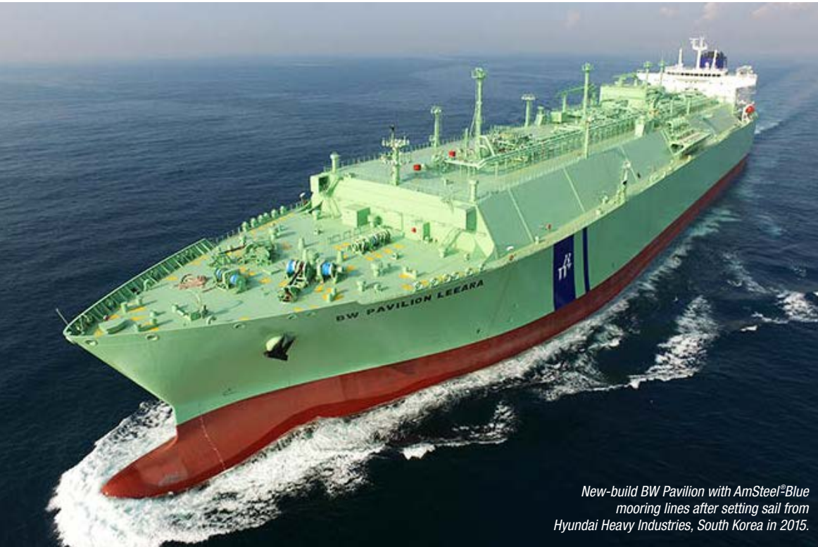
New-build BW Pavilion with AmSteel®-Blue mooring lines after setting sail from Hyundai Heavy Industries, South Korea in 2015.

Samson ropes have now been in service approximately two years on these BW FM vessels—in excess of 1,500 hours on average—with no damage reported on any vessel.