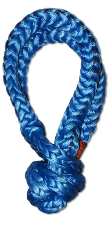
Specifications only apply to Samson manufactured Link-It soft shackles. Samson provides Link-It soft shackles with a durable tag. Please refer to tag for important use information.