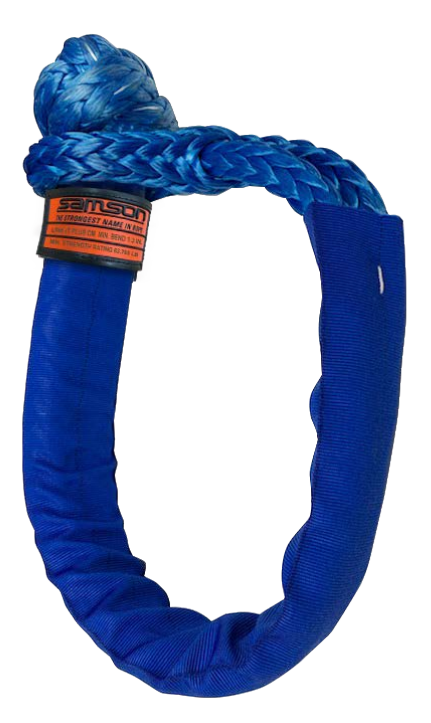
Specifications only apply to Samson manufactured Link-It Plus soft shackles. Samson provides all Link-It Plus soft shackles with a durable tag. Please refer to tag for important use information.