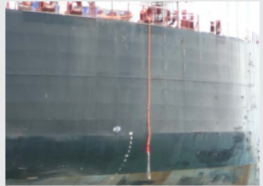
Vulcan is designed to reduce the weight of ETOPs/fire wires and minimize the risk of handling injuries.

Although a rope made solely of aramid fiber can withstand high temperatures, it has a diminished ability to withstand direct contact with a flame.