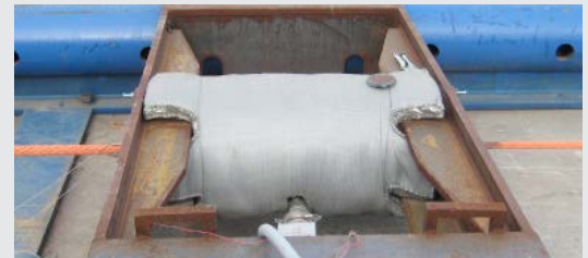
FIGURE 1 Special equipment for heat and flame testing.