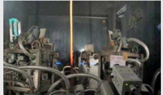
FIGURE 3 Open flame-test equipment.

Chou, C.-T., et al. High Temperature Resistant Rope Systems and Methods . United States Patent 7,743,596. June 29, 2010.