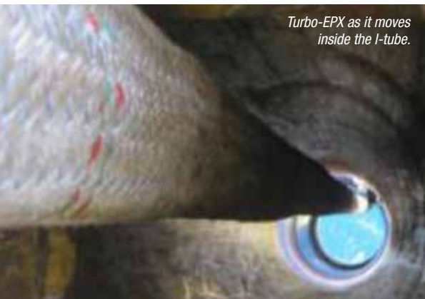
Turbo-EPX as it moves inside the I-tube.

Because of the neutral buoyancy of ropes made with Dyneema®, Technip also had concerns that the rope would catch in the propellers of the construction vessel, which would approach very close to the FPSO when the risers were transferred. Samson put application engineers to work, developing a custom solution.