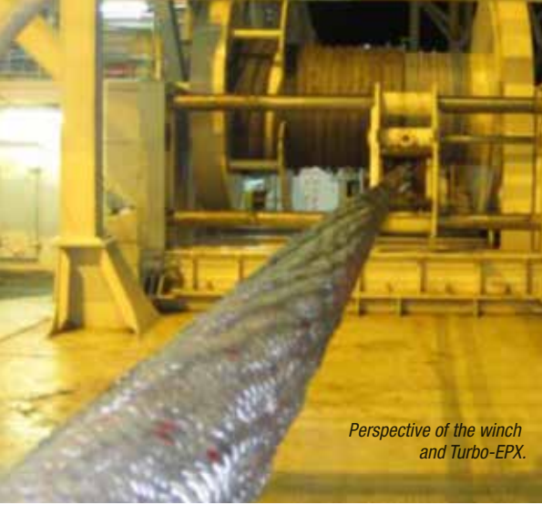
Perspective of the winch and Turbo-EPX.

Because of the neutral buoyancy of ropes made with Dyneema®, Technip also had concerns that the rope would catch in the propellers of the construction vessel, which would approach very close to the FPSO when the risers were transferred. Samson put application engineers to work, developing a custom solution.