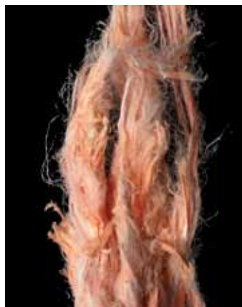
Both samples show similar damage at break points.