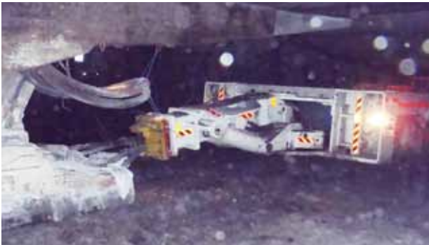
This picture represents the harsh conditions of underground mining.