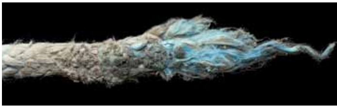
AmSteel®Blue conveyor pulling line, broken while being used to restring a conveyor belt.