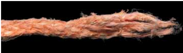
Saturn-12 sample, broken during testing.