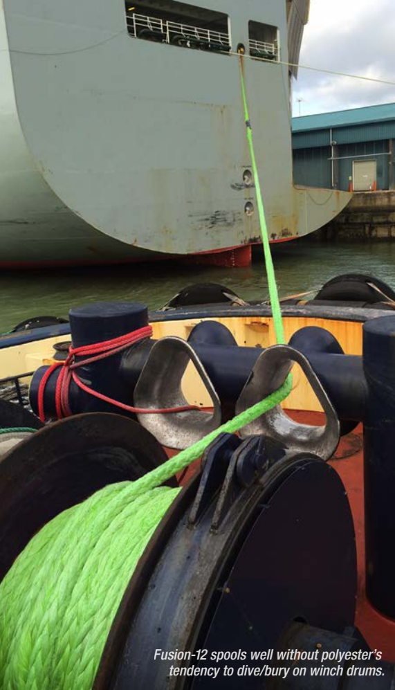
Fusion-12 spools well without polyester's tendency to dive/bury on winch drums.