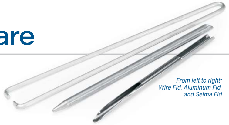
From left to right: Wire Fid, Aluminum Fid, and Selma Fid

Essential tools for splicing rope. Please note that fids and pushers can be rope-diameter specific.